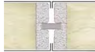
F/F magnesium oxide

* The use of a PVC profile is limited to certain thicknesses.