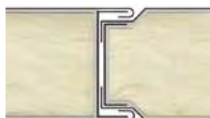
M/F steel sheet

Hand icon Upon request, internal fitting for technical equipment