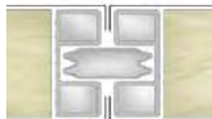
F/F PVC *